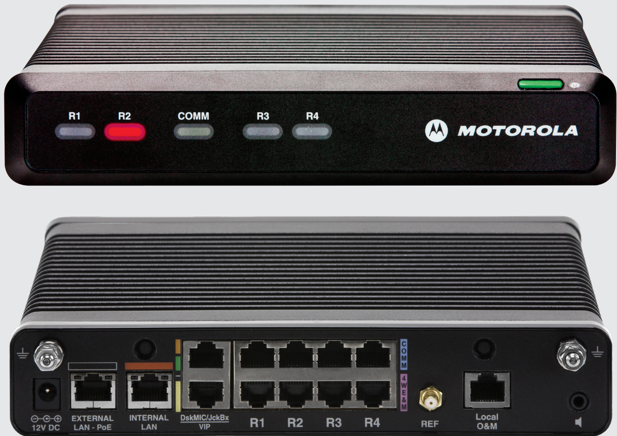
The MCD 5000 RGU connects radios to the MCD 5000 Deskset over your IP network

Our configuration tool offers the convenience of remote use from anywhere on the network or local use with an Ethernet connection. And you can provide timely support and save travel time when you remotely access your system to configure the MCD 5000 Deskset and MCD 5000 RGU. You can also remotely run reports and perform queries for information you need to make real-time decisions. Additional supervisor reporting tools allow monitoring of each MCD 5000 Deskset System devices (MCD 5000 Deskset/MCD 5000 RGU) to enhance training and operational efficiencies.